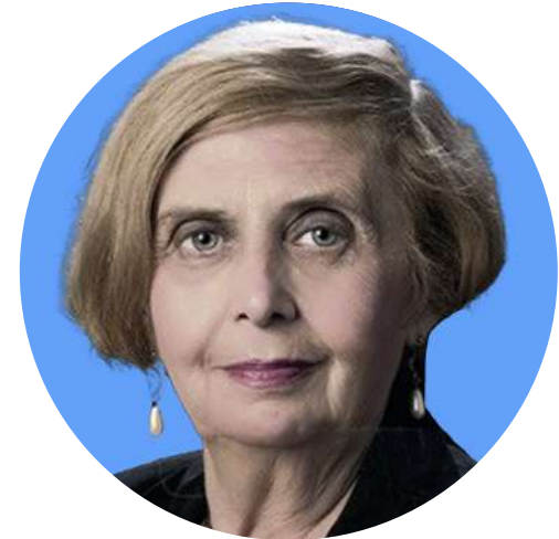
TOVA FRIEDMAN HOLOCAUST SURVIVOR UNITED STATES

Her presence at the Peace Summit will allow delegates the rare opportunity to hear the firsthand account of a survivor, enabling them to grasp the magnitude of the Holocaust and the necessity of Holocaust education. Her powerful narrative will remind delegates of the indomitable human spirit, the importance of remembrance, and the urgent need to promote peace in our world .