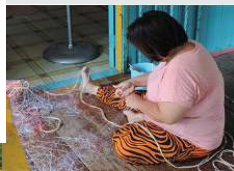
Demonstration on knitting fishing