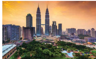
Kuala Lumpur is home to a variety of must-see landmarks and experiences.

Malaysia is a friendly, beautiful and culturally rich country. It's also extremely good value for money to travel in. Malaysia was ranked no.9 most visited country in the world.