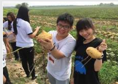
Students visit to fruit orchard