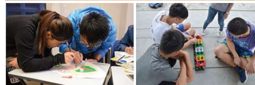
Malaysian Cultural Immersion Programme (learn Malays traditional game "Congkak-Congkit", Wau painting and making, Indian dance and etc)